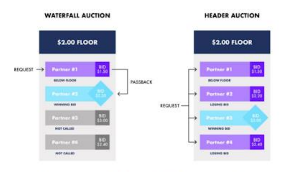
Diagram: Waterfall and Header bidder auction flows