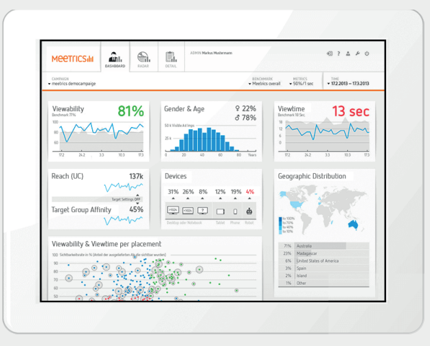
Dashboard of the Ad Attention Manager

In order to achieve the best possible efficiency for an online campaign, it is crucial to enhance the duration of the ads Viewtime. Optimisation should therefore reach the aim of being seen for a minimum of five seconds. Meetrics' Ad Attention Manager provides the opportunity to identify the placements that will be viewable for a longer amount of time. With the help of this intuitive dashboard, advertisers have for example succeeded in reducing the proportion of Non-viewable Impressions by more than 15%, and drastically increased the delivery of ads with up to 15 seconds Viewability (see fig. 2), resulting in a better viewable CPM with the overall ad recall of those ads being raised by more than 90%.